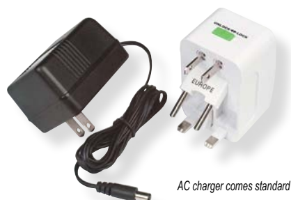
AC charger comes standard with adapter for international plug configurations.